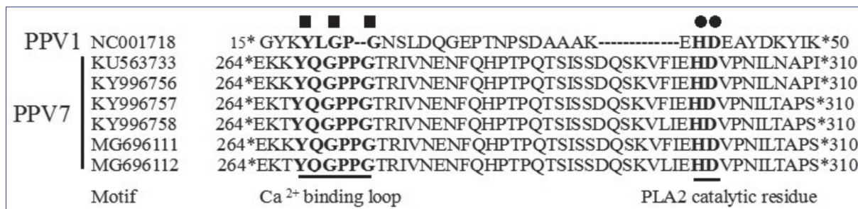
Fig 2. Sequence alignment of the putative phospholipase A 2 motif of PPV7s. The Ca 2+ binding loop is indicated by filled squares (■) and the catalytic residues by filled circle (●)