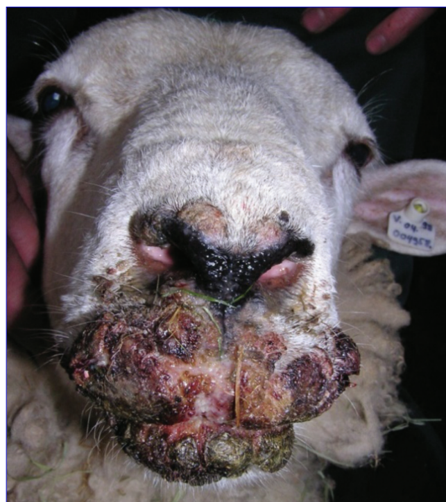
Fig 1. Clinically view of the ecthyma contagiosa in a Akkaraman sheep

PON1 activity, TSA, HDL, MDA, NO and GSH levels were measured in the blood samples taken from the animals and PCR evaluation was performed to confirm the diagnosis. In biochemical evaluations; plasma PON1 activity, HDL, and GSH levels obtained from the animals in the contagiosum disease group were statistically significantly low ( P < 0.001 )