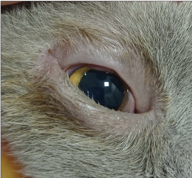
Fig 2. Entropion in the lower eyelid of the right eye in a 1-year-old male Scottish Fold cat. It was located totally