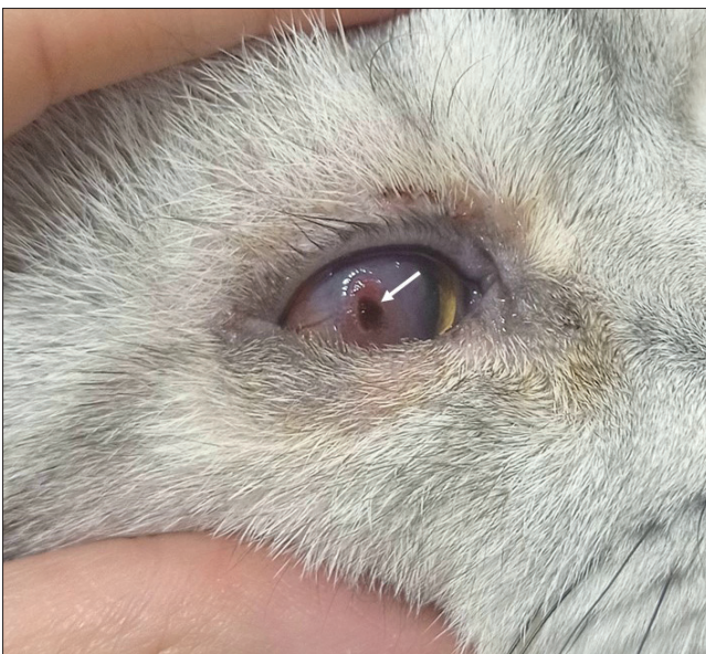
Fig 4. Severe keratitis and corneal ulceration accompanied by entropion were observed in a one-year-old British Shorthair cat. Central corneal necrosis was evident within the lesion ( arrow )