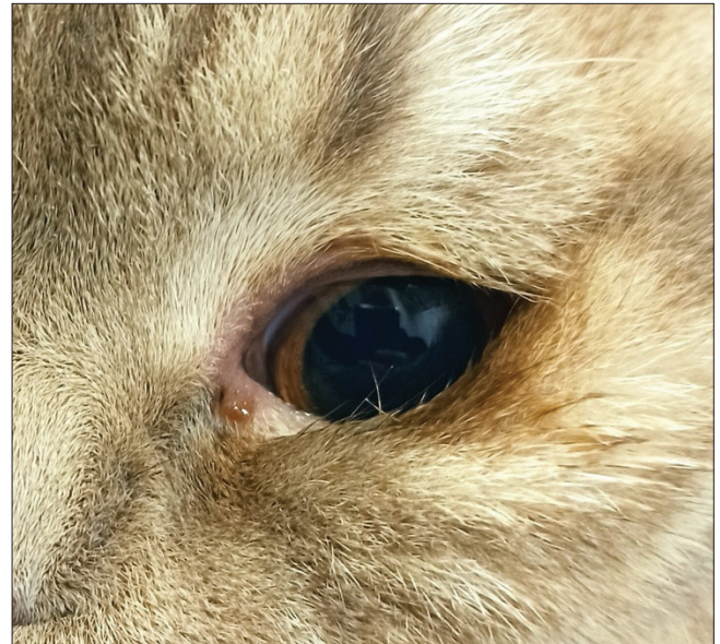
Fig 3. Severe entropion in the lateral lower eyelid with more than 180 degrees of rotation in a 1-year-old male British Shorthair