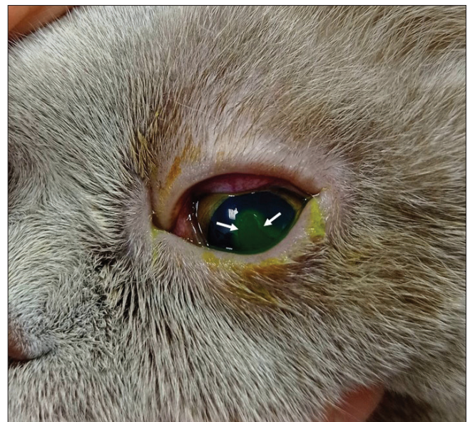
Fig 5. Based on the anamnesis, conjunctivitis secondary to entropion and a large, deep ulcer at the center of the cornea were noted. The ulcerated area tested positive with fluorescein staining ( arrows )

moderate in 35 eyes, and severe in 161 eyes ( Fig. 3 ). In the ophthalmological examination, corneal ulceration was the most common finding, observed in 36.7% of cases. A positive fluorescein test was observed in all of these animals. Conjunctivitis and epiphora were the second most common findings, each occurring in 23.5% of cases ( Fig. 4, Fig. 5 ) ( Table 3 ). All procedures were carried out by the same clinicians. While no complications occurred in animals that underwent surgical intervention, the average follow-up period was determined as 3 months.