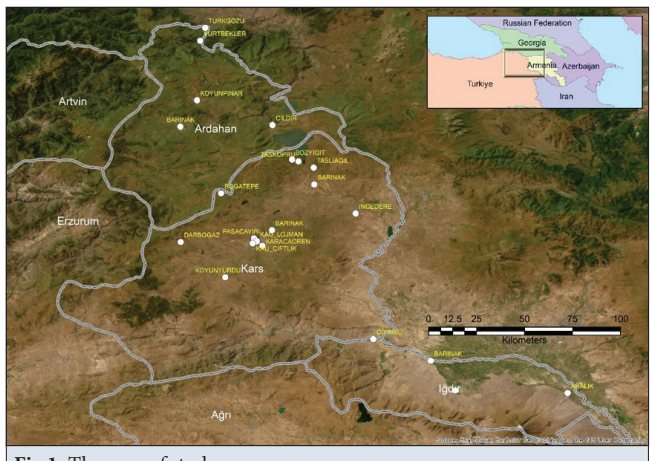
Fig 1. The map of study area

Blood samples were taken from Vena cephalica antebrachii of 400 asymptomatic dogs from various habitats, ages,