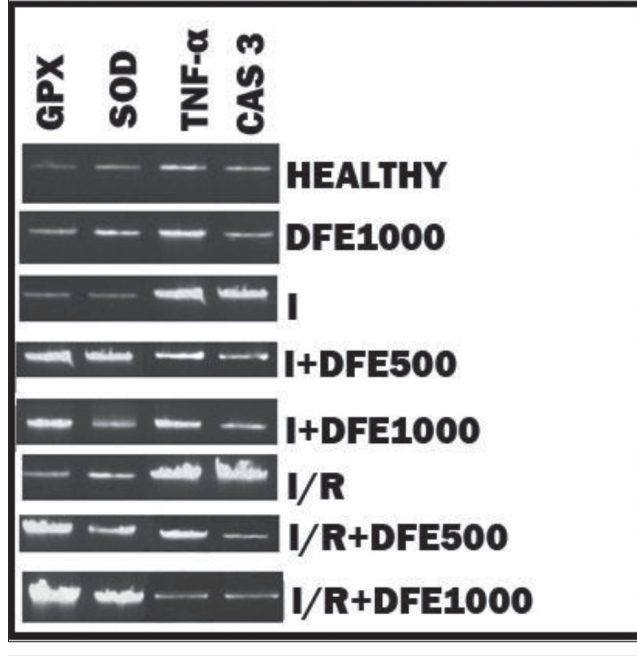
Fig 3. Comparison of molecular GPX, SOD, TNF- \alpha and Caspase-3 between groups (I: Ischemia, I/R: Ischemia and reperfusion, DFE: Dragon fruit extract)

1-D) and in the I +DFE1000 ( Fig. 1-E ) groups, we observed that loss of tissue integrity of the villi structures in the small intestine mucosa occurred mostly in the superficial region. However, inflammatory cells and edema were observed in the superficial mucosa. In these groups, areas of hemorrhage were decreased compared to the ischemia group.