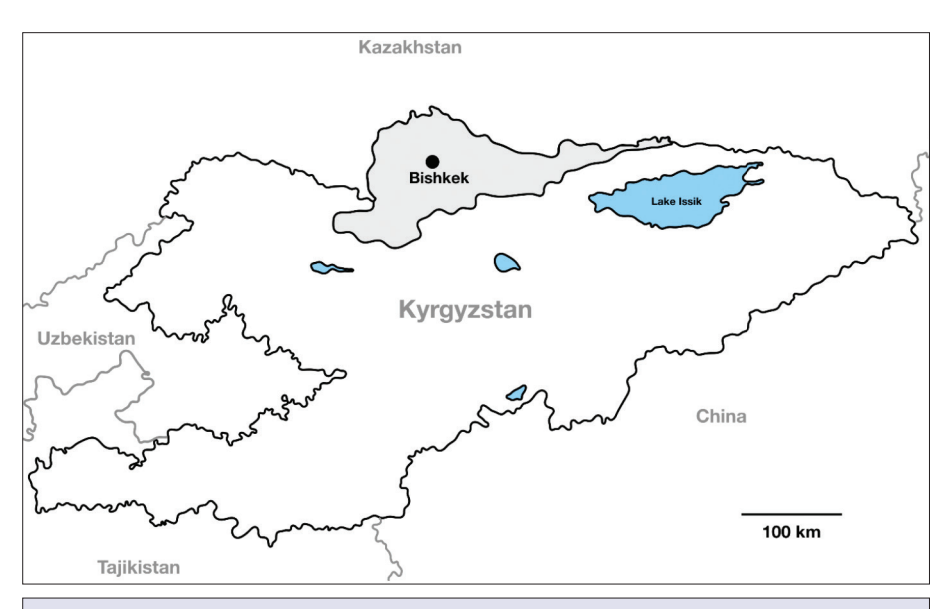
Fig 1. Map of Kyrgyzstan and location of Bishkek

For genomic DNA isolation, 200 µL blood was processed with a commercial kit [PureLink Genomic DNA mini kit (Invitrogen, Carlsbad, USA)]. Target DNA's were kept at -20°C until analysis. To determine each species, a single PCR analysis were made in a final reaction volume of 25 µL containing PCR buffer [750 mM Tris-HCl (pH 8.8), 200 mM (NH<sub>4</sub>)<sub>2</sub>SO<sub>4</sub>, 0.1% Tween 20], 5 mM MgCl<sub>2</sub>, 125 μM deoxynucleotide triphosphates, 1.25 U Tag DNA polymerase (Promega, Madison, WI, USA), primers (20 pmol/µL) and template DNA. Sequence, specificity, target gene and product sizes for primers were demonstrated in Table 1. PCR was performed with an initial denaturation step of 94°C for 5 min was followed by 32 cycles of 94°C for 1 min, 60°C for 1 min, and 72°C for 1 min. A final extension step at 72°C for 5 min was also applied [9]. Positive control DNA for Mhc (GenBank accession no: MG594502) and CMhp (GenBank accession no: MG594500) species and negative controls (nuclease-free water) were also used in the PCR