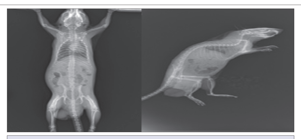
Fig 1. Radiological image of gut-generated rats