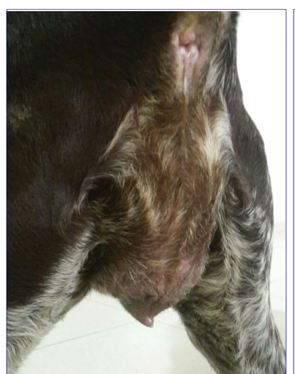
Fig 2. Ten days after the second surgery, full recovery was observed