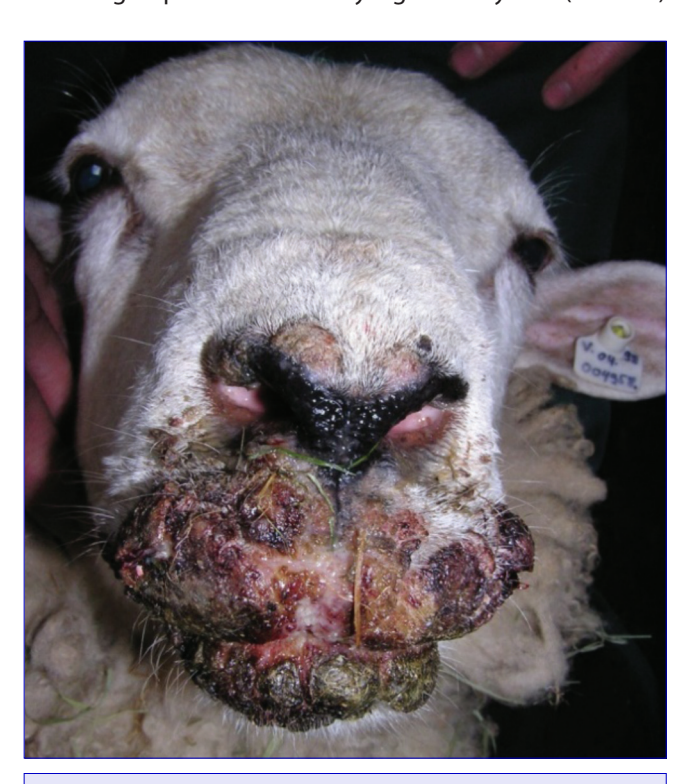
Fig 1. Clinically view of the ecthyma contagiosa in a Akkaraman sheep

PON1 activity, TSA, HDL, MDA, NO and GSH levels were measured in the blood samples taken from the animals and PCR evaluation was performed to confirm the diagnosis. In biochemical evaluations; plasma PON1 activity, HDL, and GSH levels obtained from the animals in the contagiosum disease group were statistically significantly low (P<0.001)