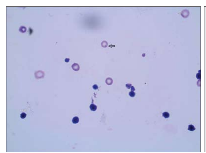
Fig 1. Photographic image of example of MN test under light microscopy (x100 magnification). Arrow indicated a MN in PCE in Group II (single injection group)

One pregnant rabbit per treatment; data are expressed as mean \pm standard error; n: number of rabbits; MNPCE: micronucleated polychromatic erythrocytes; PCE: polychromatic erythrocytes; NCE: normochromatic erythrocytes; ^{\alpha} P<0.0001 vs. Group II; ^{b} P<0.0001 vs. Group II