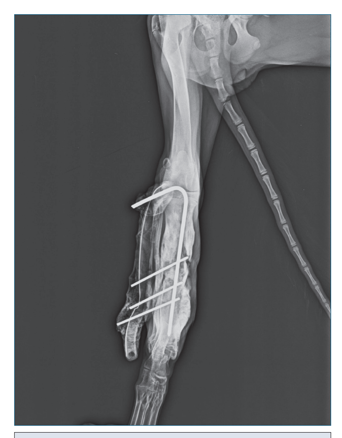
Fig 2. Radiograph on postoperative day 35 of case 7. Hypertrophic callus formed in the tibia

they followed the recommendations for confinement, they permitted the animal to move freely because it has no walking difficulties. Despite the formation of overflow callus, the animal could use the relevant extremity with ease. Moreover, 6 of the 8 dogs with femoral fractures (6 unilateral and 2 bilateral fractures) had an uncomplicated recovery, while in two dogs (cases 5 and 11,) a complete recovery was not achieved because the owners were following the confinement recommendations, which results in the protrusion of the transversal pins. The external fixator was removed, and stabilization was accomplished with the plate in these two dogs that could not fully heal.