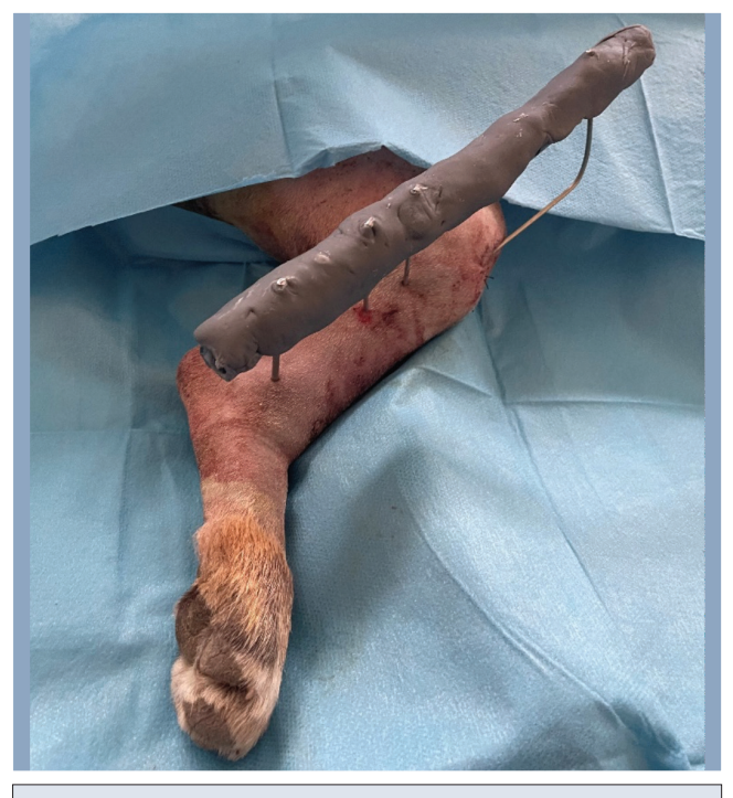
Fig 1. Fixation of postoperative "tie-in" external fixator components