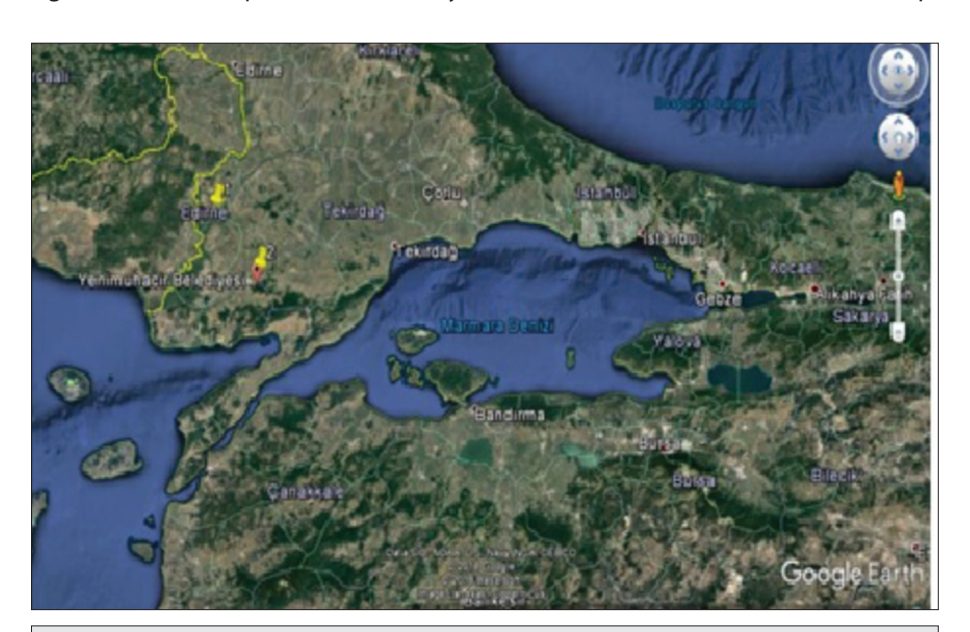
Fig 1. The geographic location of the study region

The experiments were established on May 2, 2016. Two groups were formed as package bee and artificial swarm in the experiments. The experiments were carried out according to the Completely Randomized Design, which will cover 12 beehives in each group ( Table 1 ). Considering the main nectar flows in the region, package bees and artificial swarms were sent eight weeks before the beginning of the main nectar flow. After the package bees were