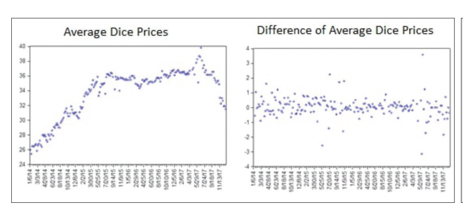
Fig 1. Testing of stationarity of dice series from January 2014/1 to December 2017/52 using ADF test (Avarage exchange rate for 2017: 1 USD = 3.65 Turkish Lira)

ADF and PP test values of the veal cubes series from January 2014/1 to December 2017/52 after taking its first difference are significant at a significance level of 1%, 5%