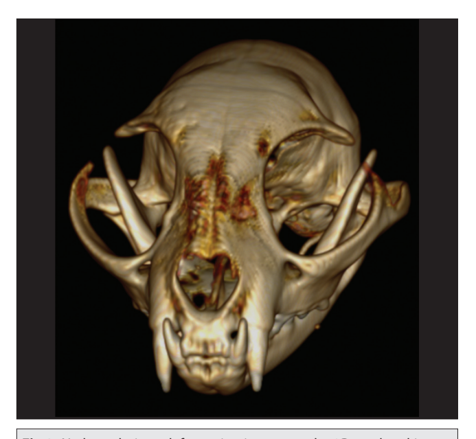
Fig 3. No bone lysis or deformation is seen on the 3D rendered image of the 1^{\rm st} case