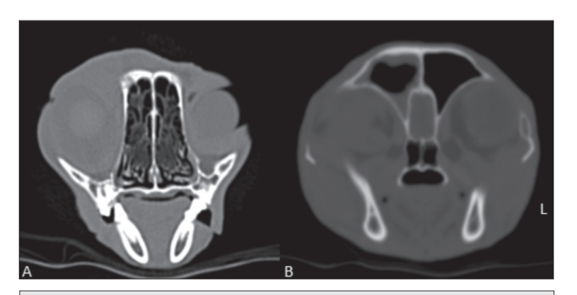
Fig 2. The mass over the right orbit and nasal bone with no invasion to the nasal cavity (A) and increase in soft tissue density on in the right frontal sinus (B)