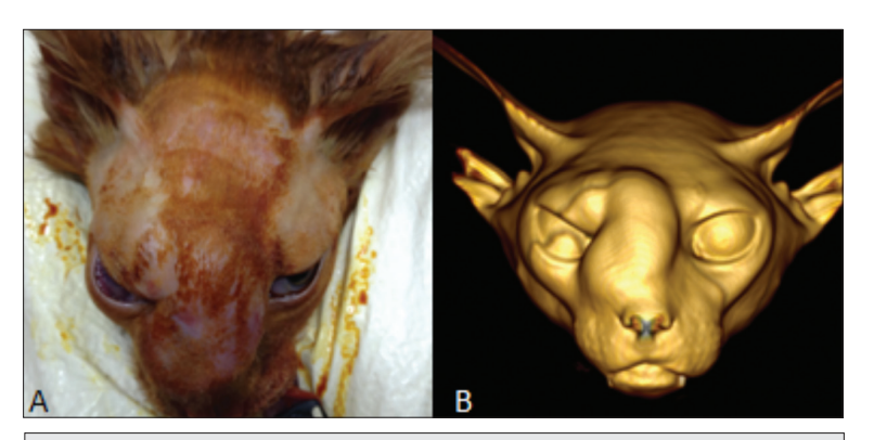
Fig 1. The preoperative (A) and 3D rendered CT image (B) of the 1st case

the frontal bone of the skull, with a mediocre invasion of the right orbit, pushing the right eye cranially and laterally. No bone lysis or septal deviation was seen in the nasal bone or skull, and there was some soft tissue contrast inside the right frontal sinus ( Fig. 2 ).