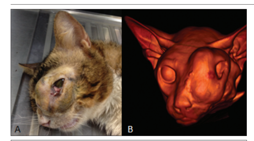
Fig 4. The clinical (A) and 3D rendered CT image (B) of the 2<sup>nd</sup> case