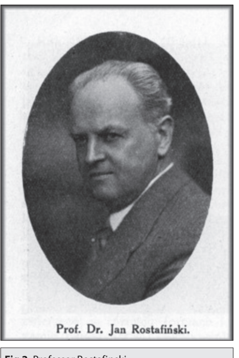
Fig 2. Professor Rostafinski

unless it is hybridized with 'Nonius'. He noted that the biggest problem of animal breeding was the reason that racing associations in Izmir, Istanbul and Karacabey were not subsidized. He specified that the field structure of Karacabey studfarm was suitable to be transform into a race track; and he suggested that the race horses should be bred in that place. He emphasized that if they work fast enough, Turkey could be a significant worldwide "east animal (probably Arabian horse) resource. He indicated that horse breeding should be adopted as a government policy and animal owners should be encouraged.