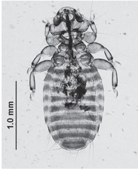
Fig 4. Myrsidea picae , female, original