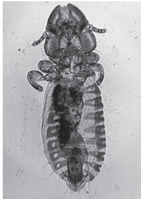
Fig 2. Brueelia biocellata , male, original Şekil 2. Brueelia biocellata , erkek, orijinal

Approximately, 4000 valid lice species were found on the birds throughout the world 2 . There are 468 bird species recorded in Turkey so far and the actual total is likely