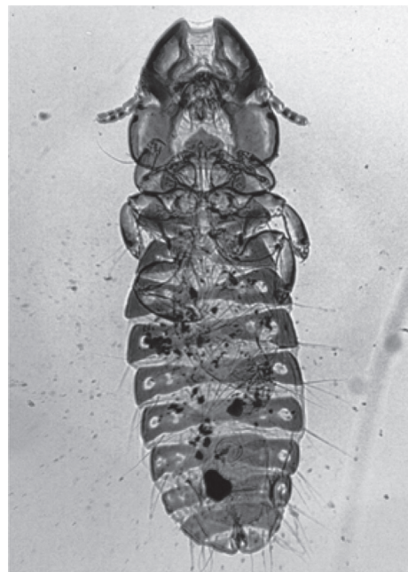
Fig 3. Brueelia biocellata , female, original Şekil 3. Brueelia biocellata , dişi, orijinal

to exceed 500 species 8 . However, almost all of the louse fauna of these birds are still unknown.