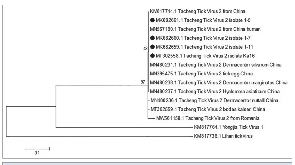
Fig 2. Phylogentic analysis of TcTV-2 partial S segment in Kazakhstan. Phylogenetic analysis was analyzed by Mega7 (Maxmum likehood, Bootstrap 1000), reference sequences were marked with black circle