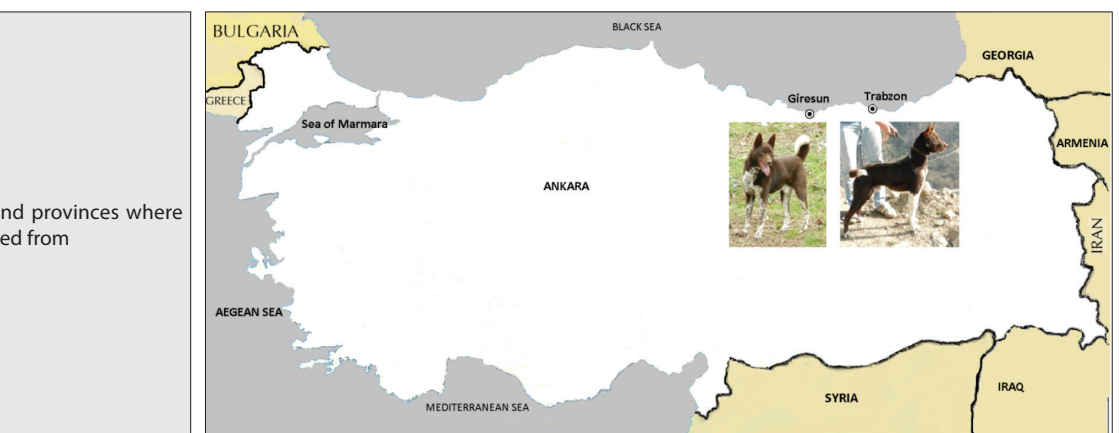
Fig 1. Zerdava dogs and provinces where the samples are collected from

presented in Table 1 . The mean live weight values of Zerdava dogs were 16.02\pm0.35 kg. The mean withers height, rump height and body length were found to be 48.20\pm0.21 , 47.08\pm0.24 and 51.24\pm0.23 cm, respectively. The mean head length was recorded as 20.95\pm0.09 cm, the face length was 8.49\pm0.05 and the ear length was 10.04\pm0.07 cm. The withers height, rump height, chest depth, chest circumference, live weight, shank circumference, distance between the ears, ear length and mouth circumference were statistically significant depending on age. Moreover, the withers height, rump height, body length, chest depth, chest circumference, shank circumference, head length, face length, ear length, tail length and mouth