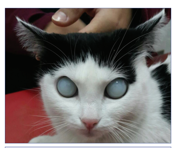
Fig 1. A five-years-old neutered female cat with the complaint of sudden onset of binocular blindness due to a white cloudy appearance in both eyes