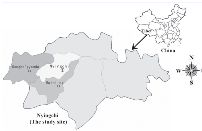
Fig 1. Collection sites of samples in Nyingchi, Tibet China

Viral RNA of the four isolated strains was extracted using TIANamp Virus DNA/RNA Kit (TianGen, China). Reverse transcription PCR amplification approach was performed using Quant One Step RT-PCR Kit (Tian Gen, China) with primers for the F gene (~1662bp). Based on the published F gene sequences in the GenBank database, we designed a pair of primers with the help of Primer Premier Software (version 5.0) and synthesized by Wuhan Qingke biotechnology CO., LTD (Wuhan, China). The primer forward: ATGGGCTCCAGAC CTTCTACCA and reverse CATT TTTGT AGT GGCTCTCATCTGAT was used and commercial RT-PCR Kit (TianGen, China) was used for reverse transcription. The RT-PCR mixture contained 14.2 µL RNase-