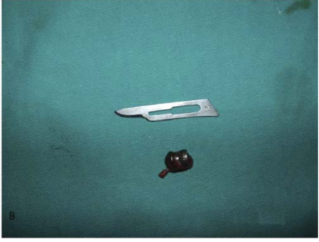
Fig 1 (A,B). Air rifle pellet detected in bursa ovarica Şekil 1 (A,B). Bursa ovarikada tespit edilen havalı tüfek saçması