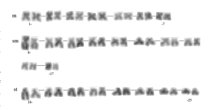
Fig 2. Karyotype of Pseudorasbora parva Şekil 2. Pseudorasbora parva 'nın karyotipi

Most authors consider subtelocentric chromosomes biarmed and some authors regard them monoarmed <sup>25,26</sup>. In the present study, subtelocentric chromosomes were accepted as biarmed when calculating FN. Meta-