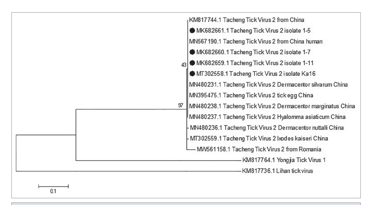
Fig 2. Phylogentic analysis of TcTV-2 partial S segment in Kazakhstan. Phylogenetic analysis was analyzed by Mega7 (Maxmum likehood, Bootstrap 1000), reference sequences were marked with black circle