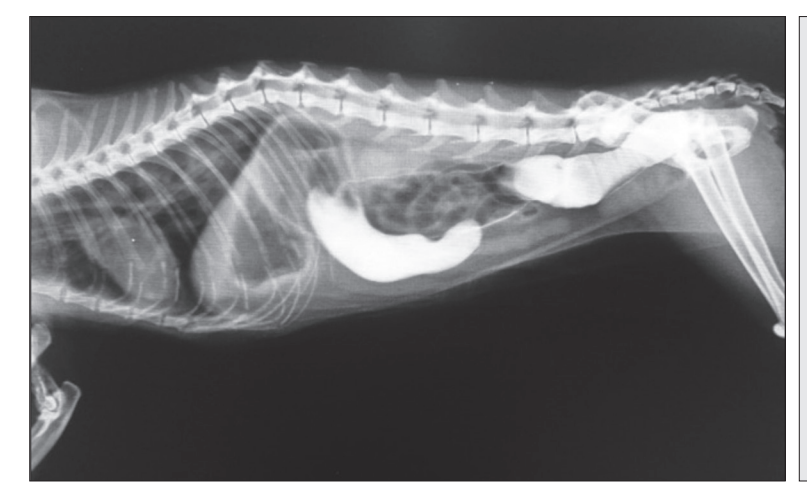
Fig 1. Radiographic appearance of the cat 72 h after contrast agent administration. The obstruction could be seen in the colon descendens

the patient was examined by further radiological tests with contrast material to differentiate obstructive or nonobstructive distention. As a result, local obstruction of the colon descendens was observed on radiographs 72 h after iohexol contrast media (Omnipague; GE Healthcare) administration (700 mg iodine/kg with an iodine concentration of 300 mg iodine/mL diluted with tap water until a total volume of 10 mL/kg, via an orogastric tube) (Fig. 1). The patient then was referred to median laparotomy to determine the reason of the obstruction. Surgical laparotomy was performed under general anesthesia and a mass 1 cm in diameter was found on the abdominal wall showing adhesion with increased adipose tissue to mesenteric margin of the colon descendens. The mass and the increased adhesive adipose tissue were completely removed, and the omentalization of the area was carried out. The mass was submitted to Pathology Department of IUC Veterinary Faculty for histopathological examination. Postoperative treatment was provided with intestinal diet (digestive care i/d, Hills) and with metoclopramide (Metpamid; Sifar) 1.0 - 2.0 mg/kg/d IV as a constant rate infusion with isotonic serum for 72 h as a parenteral fluid replacement to treat the severe dehydration and general condition of the animal. Then the additional application for metoclopramide (Metpamid; Sifar) was initially provided with 0.2 mg/kg, SC, q8h for 4 days and then given orally