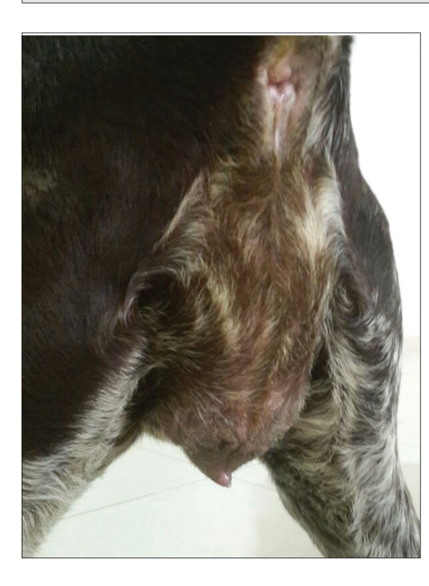
Fig 2. Ten days after the second surgery, full recovery was observed