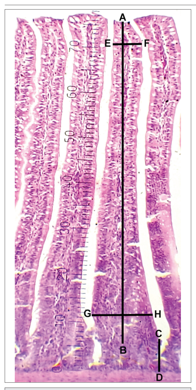
Fig 1. Section of the jejunum (thermal conditioned and OEO supplemented group), haematoxylin-eosin stained, showing the measured parameters. Villus height [AB], crypt depth [CD], villus edge widths [EF] and villus bottom widths [GH], (x 200)

from small intestines were determined by counting the IR ECs in 10 randomly selected microscopic fields with 40x magnification (quantification of IR ECs number/ microscopic field).