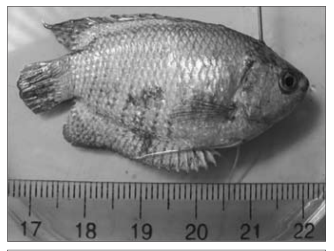
Fig 3. Dwarf gourami fish ( Colisa lalia ) with skin lesions Şekil 3. Deri lezyonlu cüce gurami balığı ( Colisa lalia )

Prevalence, abundance, mean intensity and percentage of infection for four years are shown in Table 1 .